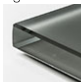
extra clear frosted glass graphite painted