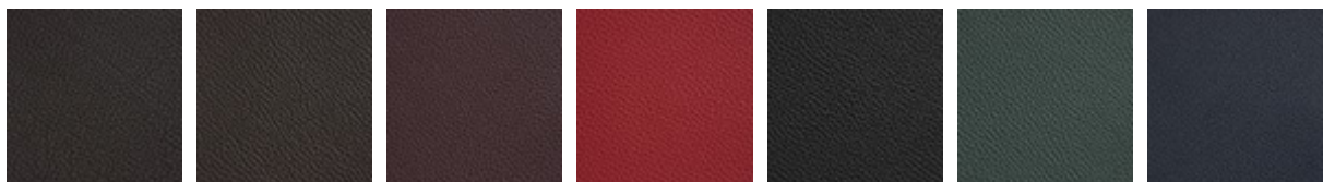
943 MOKA 891 TESTA DI MORO 944 BORDEAUX 989 ROSSO CORSA 973 NERO 987 SHERWOOD 940 NAVY