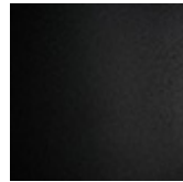
GFM73 black embossed