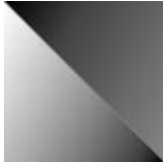
satin iron grey