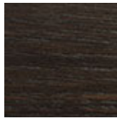
RB burned oak